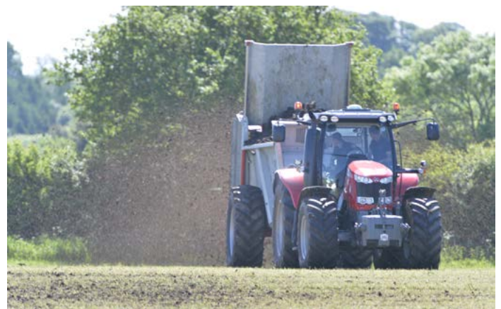
Figure 3. Muck spreader

Experience has shown that improvement in productivity in arable systems after improved organic matter management takes some time to appear. Defra research has shown measurable benefits of improved organic matter management, in addition to any nutrient supply benefits, but these are often only realised after at least six years of implementation. AHDB research suggests that farmers should first consider the nutrient value of any imported materials. Once these have been taken into account, it is rarely economic to spend more than a further £30 per tonne (dry matter) of organic materials added to soil per hectare (including the costs of material, haulage and spreading).