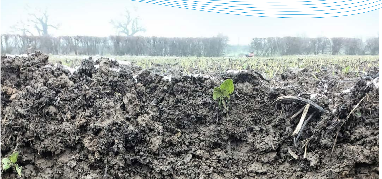
Figure 1. Well structured clay loam soil in an arable rotation with organic matter distributed throughout the topsoil