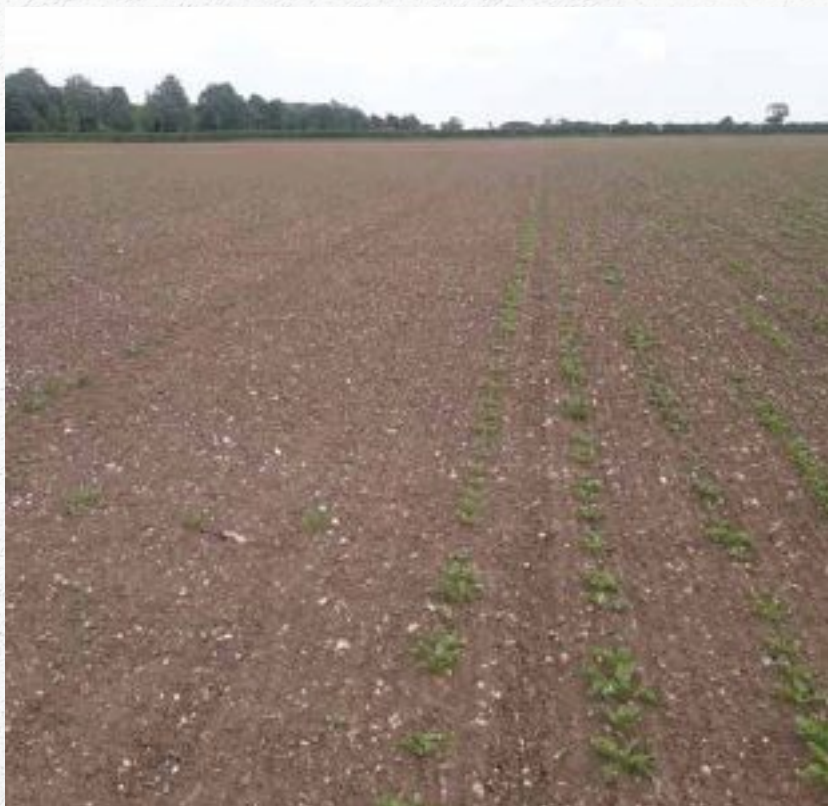
Fig. 3. Example of the impact of drill set up on speed of emergence

The final process is clearly drilling, and observations from 2020 show how critical it was to ensure seed is placed into moisture. Fig 3 shows that drill depth can have an immediate impact on speed of establishment and the importance of adjusting drill depth and pressure to suit each seedbed. Once the target seed depth has been identified and adjusted for, it is equally crucial to ensure it is achieved consistently to avoid uneven establishment. Whilst both of these things are often associated with the drill performance it is important to remember it is also a consequence of the seedbed preparation and both need to be optimal to achieve the best results.