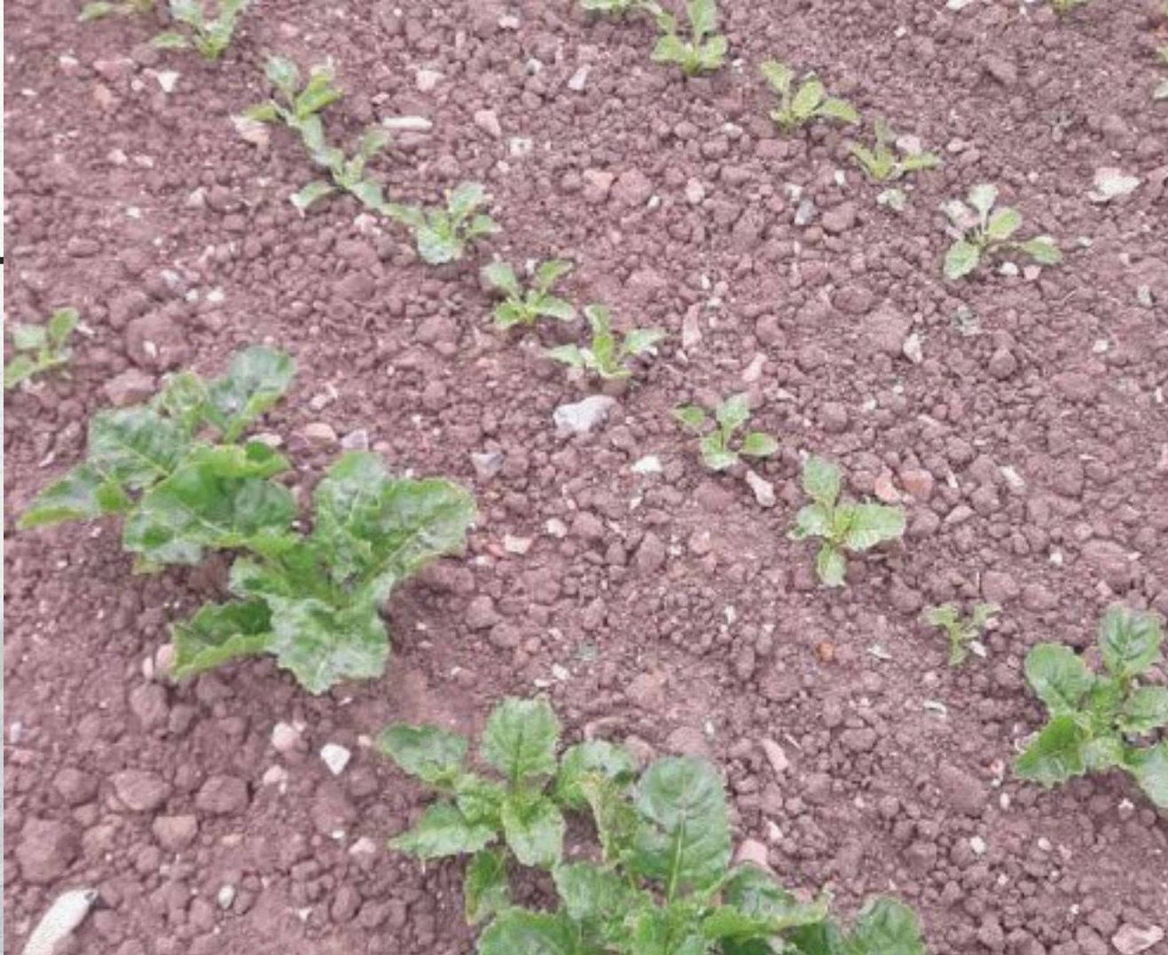
Fig. 4. Example of inconsistent seedbed (moisture) producing variable emergence