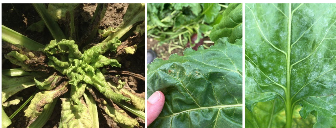
Fig 3: From left to right: downy mildew, rust and powdery mildew.

The chart below provides a summary of the fungicide options for 2023. Where the risk is high avoid cutting rates as efficacy and persistence will be compromised. Revystar XE has been found to be more effective on cercospora at the higher rate of 1 litre/ha (not 0.8 litre/ha). The Impact product label only claims moderate control of cercospora and ramularia for up to 2 months and may provide insufficient activity in situations where disease is established, and pressure is high.