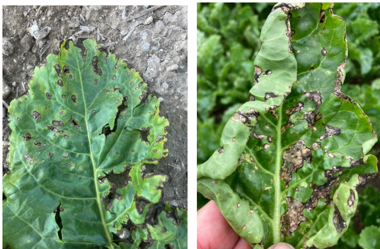
Fig 5 Bacterial leaf spot - note the more irregularly-shaped lesions

Bacterial leaf spot - more bacterial leaf spot in crops has been reported this season than usual, especially where crops are or have been stressed. This will be due to the warm and wet conditions. Remember that this is a bacterial disease and fungicides will not provide any control. Therefore, be careful not to confuse bacterial leaf spot symptoms with those of cercospora, applying a fungicide unnecessarily. Bacterial leaf spot symptoms are more irregularly-shaped spots/lesions than cercospora, with a tan centre and deep brown/black borders. These often occur more frequently on the leaf margins compared to cercospora and there is usually some yellowing of the leaf around the infected spots/lesions. The spots can coalesce into areas of necrosis which may then collapse leaving holes in the leaf.