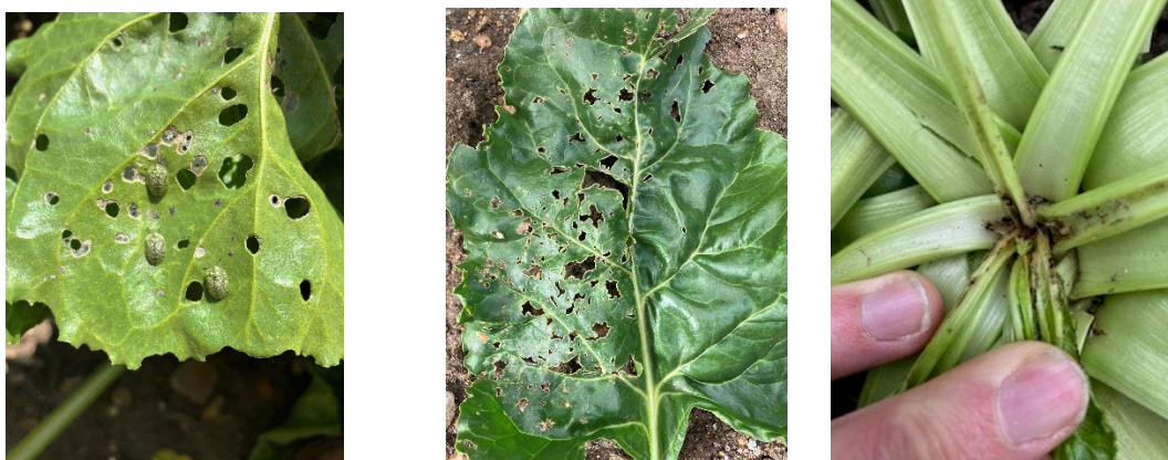
Fig 6: Canopy feeding damage. Tortoise beetle (left) caterpillar feeding damage (centre) and beet moth damage (right)

Leaf feeding pests - there are signs of feeding damage to leaves but at this stage, this is not expected to cause significant yield loss. Tortoise beetle have been found again this year in crops. This is an uncommon pest. It tends to form more regular circular holes in the leaf when feeding than other leaf-feeding caterpillars. Some Silver Y moth caterpillars have been observed in crops but not at a level not associated with significant yield loss, especially where healthy canopies exist. A threshold of 5 caterpillars per plant is usually associated with yield loss and the possible need for control.