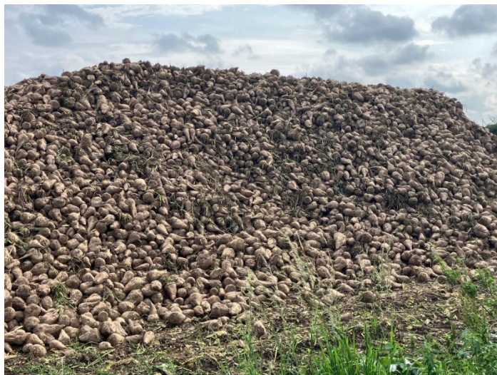
Fig 6: Avoid leaving large clamps (more than 2m in height) with lots of soil and tops for more than a few days in warm conditions.

Ensure a regular dialogue between harvester and haulier and avoid leaving large clamps for longer than necessary before delivery, particularly given current temperatures. Avoid too much soil and top in clamps. Check cleaner loaders are working correctly and not causing any damage.