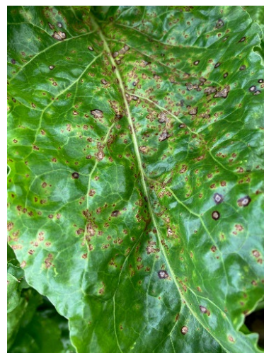
Fig 1 (right): Mostly rust with some cercospora symptoms visible on the same leaf a typical example of this season's canopy.

Whilst cooler temperatures and fungicides have helped prevent further rapid wider cercospora infection in crops, the severity of earlier infected plants has increased (see Figure 2) demonstrating how the symptoms can continue to progress. Whilst persistent leaf wetness is a factor, new BBRO work is looking at the cercospora strains present in crops to understand whether these are more adapted to UK conditions and, any indication of fungicide resistance.